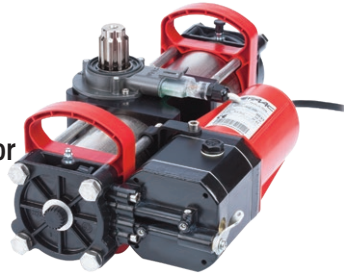
S800H In-Ground Hydraulic Operator