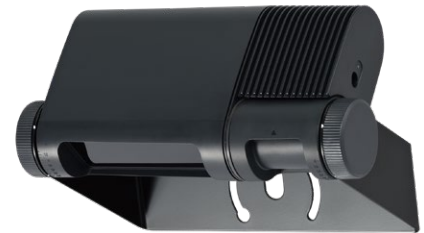
OAM Explorer Industrial Door Monitor