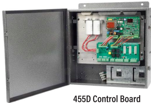
455D Control Board