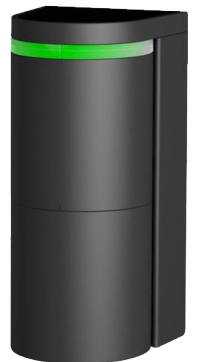
OVS-02GT Virtual Loop