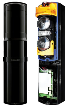
OVS-50TNR Monitored Hybrid Thru-Beam